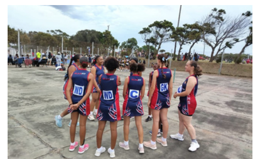
Team work makes the dream work