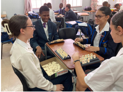
The matrics playing a round of Rummikub