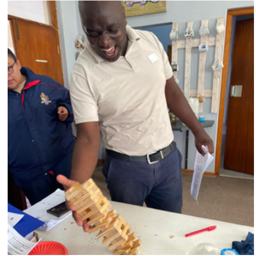
The teachers getting involved in the Pi Day fun