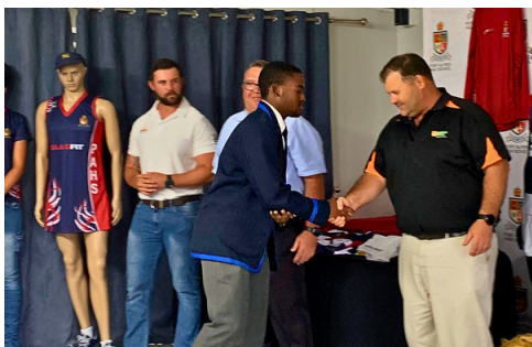
Thanking our sponsors for the kit