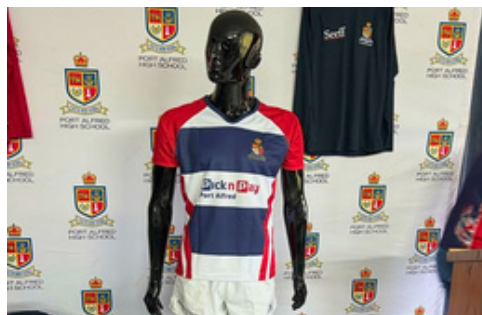
The 1st team rugby kit