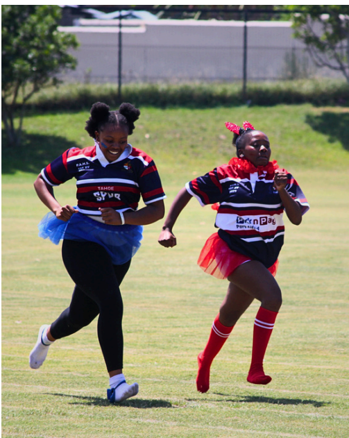
Sprinting to the line