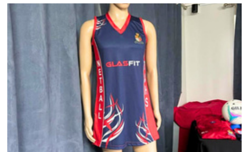
The 1st team netball kit