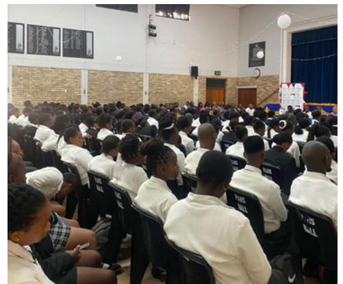
The matrics filling the hall for orientation