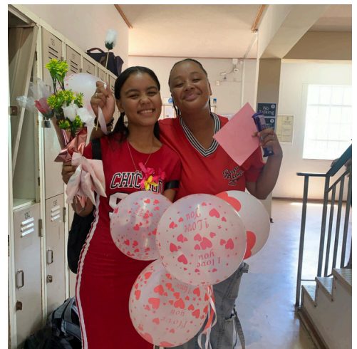
Some of the ladies wearing red for valentine's day!