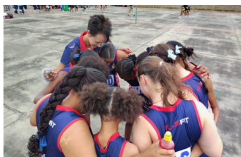
1st team netball at Andrew Rabie Ratel Festival