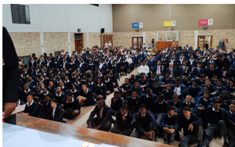
The high school packed into the hall to watch the grade 8s lighting ceremony

The newest members of the PAHS high school, the grade 8s, were the centre of attention at their candle lighting ceremony on the 20th January 2025. This special assembly was joined by the parents of the grade 8s. The ceremony began with all the grade 8s walking onto and across the stage where they would receive a bookmark.