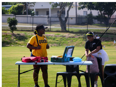
The first aid team hard at work saving multiple learners from heat stroke