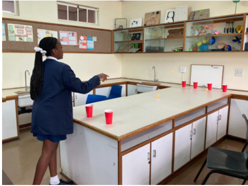
Pi Pong for the grade 10s