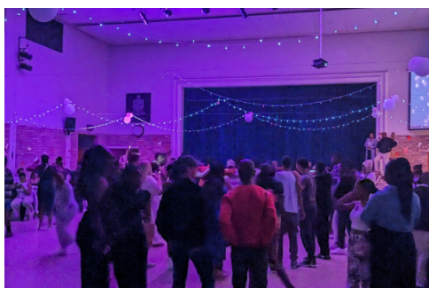
The hall set-up was beautiful for the school valentine's dance