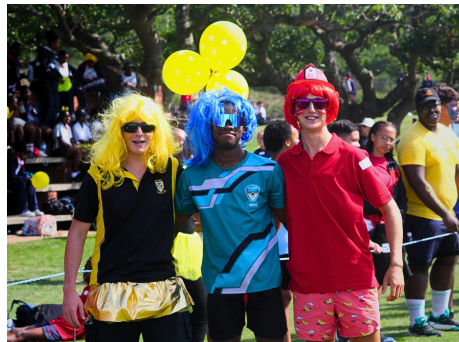
Despite different houses, the friendship remained for the matrics