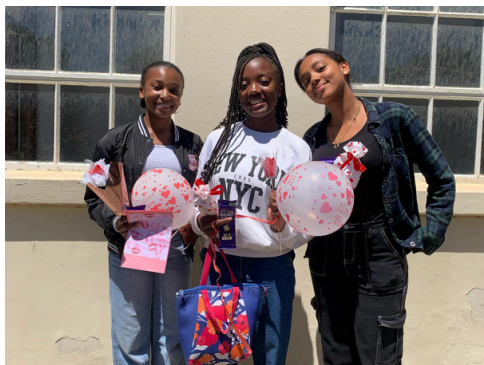
Grade 10 girls enjoying their valentine's gifts