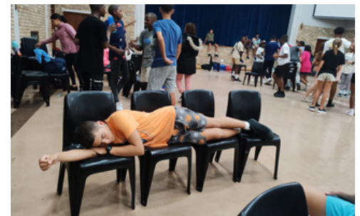
The late night affected a few of the students...