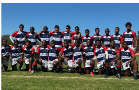
1st team rugby at Graeme Rugby Festival