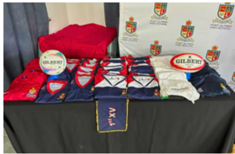
The 1st team kits laid out on the table