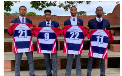
The rugby boys posing with their kits