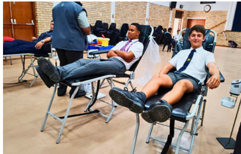
Matric learners donating their blood for a good cause