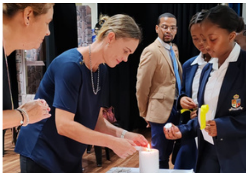
Grade 8 learners lighting their candles