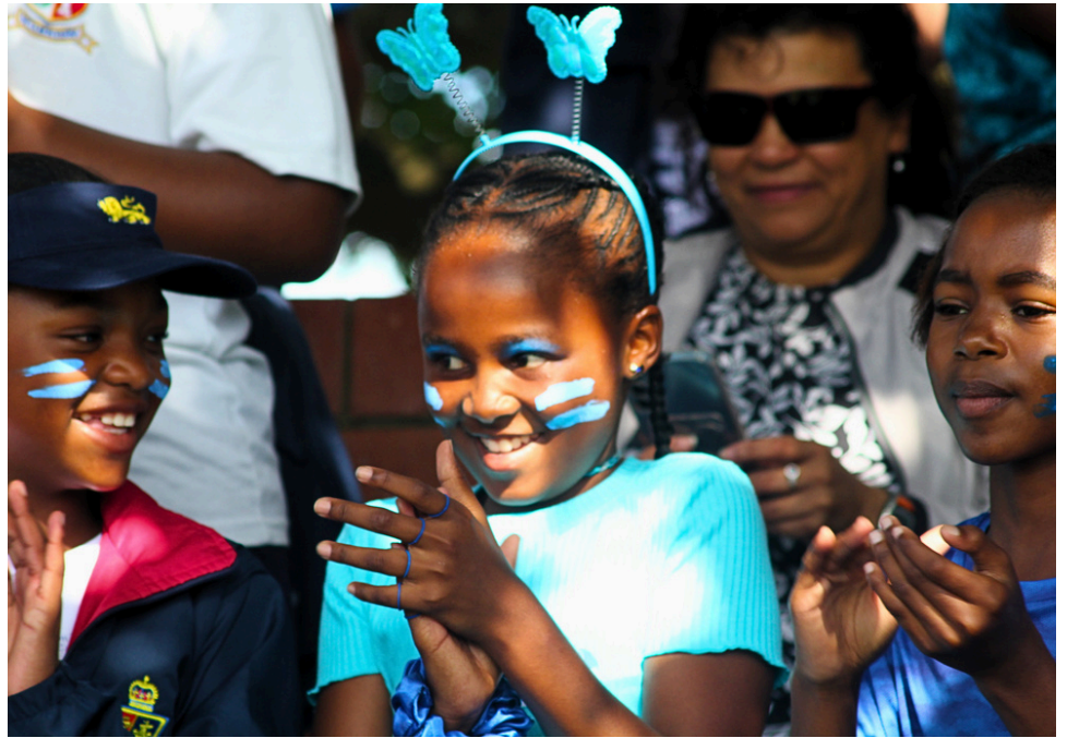
The Gees in the stands was unmatched

Finally, the scores were announced, concluding the 2025 interhouse athletics days. Congratulations to Orffer House in third place, Harvey House in second place, and -by three points- Hobson House in first place. A special round of applause for the high school for breaking a total of 15 records!