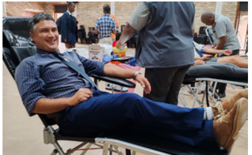
Mr. Murray creating an excuse to miss rugby practice