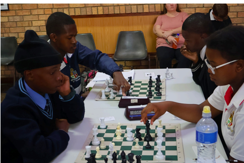
PAHS Chess team at the Makanda Chess Trials