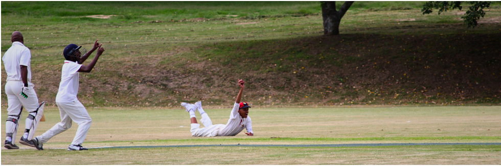
Shouts of 'HOWZAT?!' echoed over our cricket field throughout pineapple cricket week