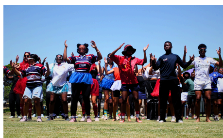
The matrics rocking the best dance moves!