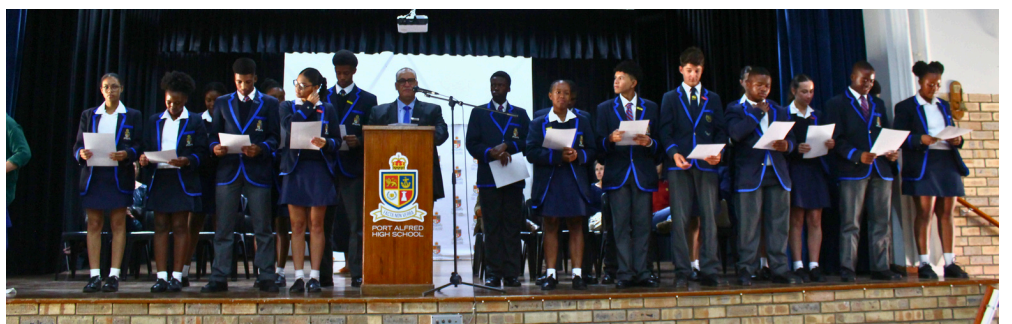
The prefects taking their oath to serve the school