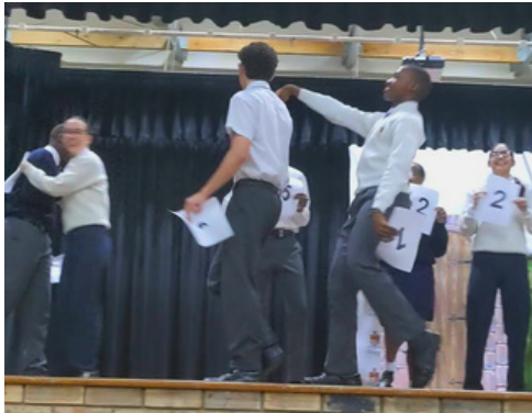
The grade 12 maths class owned the stage for Pi Day